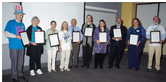
NAMIWalks SF Bay Area Top Ten Teams