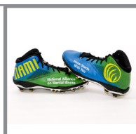
49ers Page 2