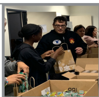
Holiday Drive Page 3