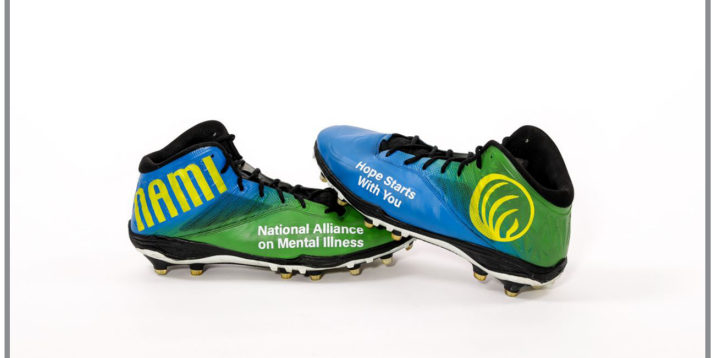
Laken Tomlinson wore the NAMI Cleats at the My Cause My Cleats game against the Saints.

The 49ers offensive guard Laken Tomlinson showed his support for NAMI during the My Cause My Cleats football game on December 8 when they beat the New Orleans Saints.