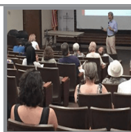
General Meeting Page 2