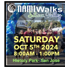
NAMI Walks 3