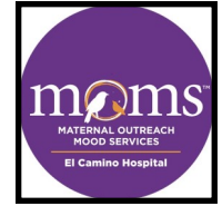
MH Symposium 4