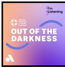
Suicide Prevention 2